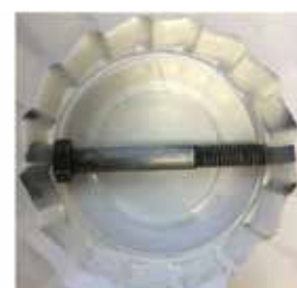
steel Rod with water + Admix PCI